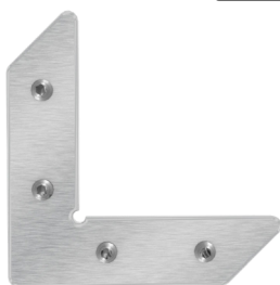
Steel Corner #2000